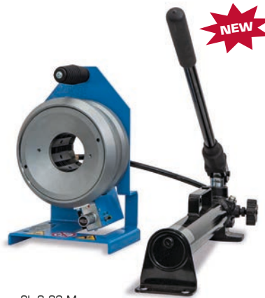
SL 3-32 M