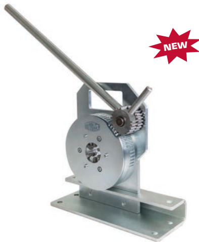
SL 3-16 M