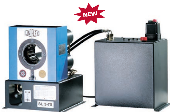
SL 3-75_A M